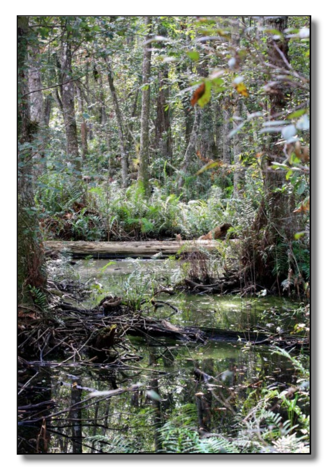
Brooker Creek, photo by Patti Young.

Pinellas County had historically an agricultural-based economy, but that changed rapidly in the 1970's and '80's. During the period from 1970 to 1990, the County's housing units doubled from 228,771 to 458,341. Simultaneously, agricultural acres (mostly citrus) declined in the decade between 1976 to 1986 from 3,770 acres to 394. By 1990, 81 percent of the County's land had been developed.