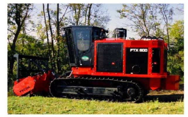
Thank you, County Commission, for approving the lease of this much needed budget item!