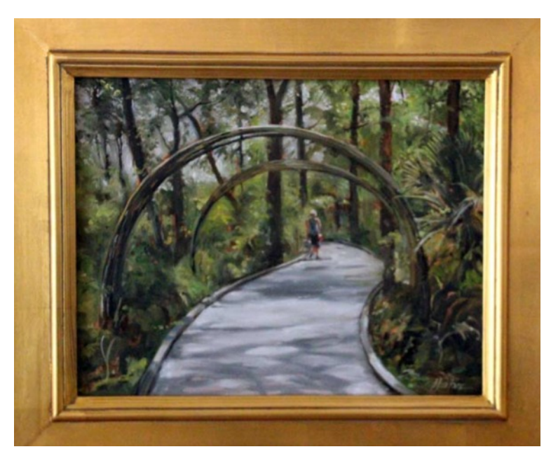
Elaine Hahn, "Morning Stroll," oil - 1<sup>st</sup> Place Painting

best photos including two $100 awards for the best painting and the best photo done in Brooker Creek Preserve, sponsored by the Friends.