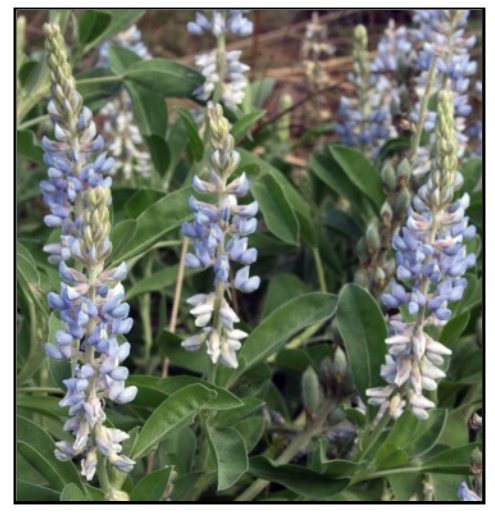
Sky-blue lupine (Lupinus diffusus)