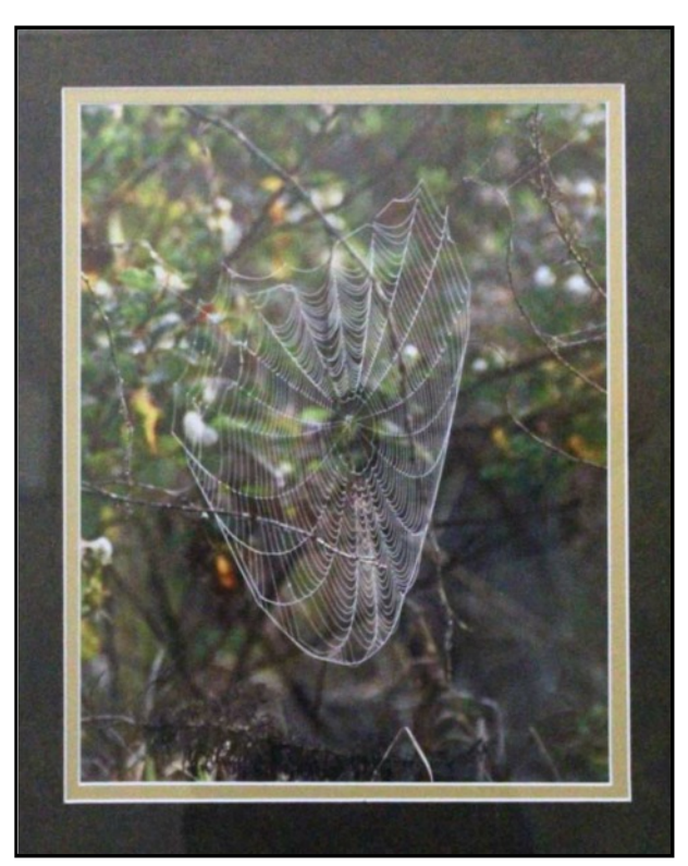
Sue Thomas, "Home Sweet Home" – 1<sup>st</sup> Place Photography