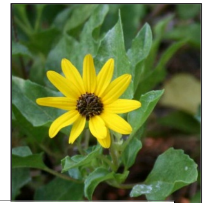
dune sunflower (beach sunflower)