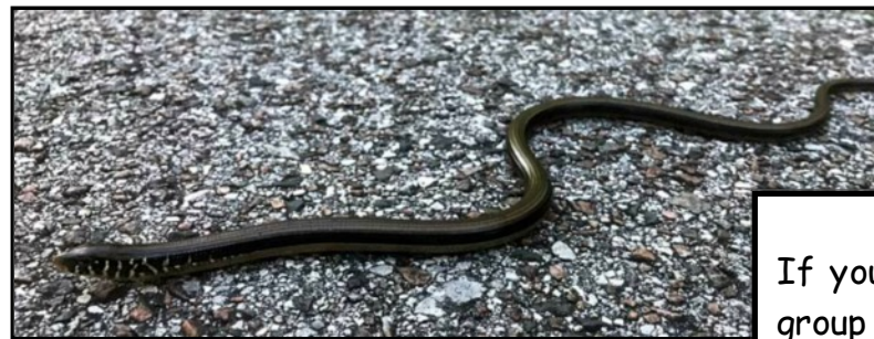
Glass lizard.

Save the Date: Our annual Volunteer Appreciation Celebration will be on Sunday, January 7<sup>th</sup> at noon. We look forward to showing you all our appreciation, more details to come!