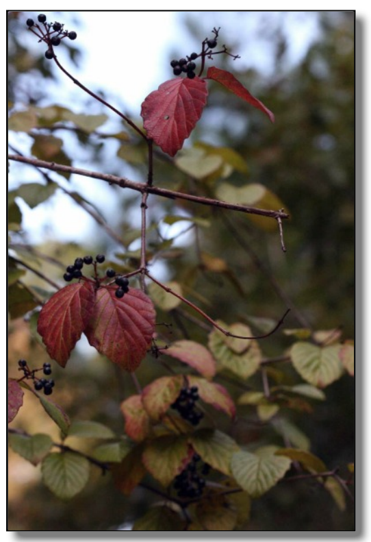
Arrowwood viburnum.

As Floridians, we rarely get the type of fall color in our foliage as states to our north. Some of us become part of the enormous exodus to fall-color states in order to view it. Make no mistake about it, the economic impact of fall-color viewing is staggering. The New Hampshire Division of Travel and Tourism Development projects the state will see 8.2 million visitors this fall, and they're expected to spend $1.6 billion. In 2009, New Hampshire had 7.5 million fall tourists, spending a total of $1 billion. Vermont had 3.6 million fall tourists and $460 million in spending in 2011, the last year for which comprehensive figures are available, up from $331 million in 2009 with roughly the same number of people visiting. Visits to state parks in the Green Mountain State are expected to surpass 950,000 this year, an increase of 8% and the highest visit count since 1989, according to state tourism officials. A conservative estimate is that fall color tourism contributes a minimum of $1 billion per year to the