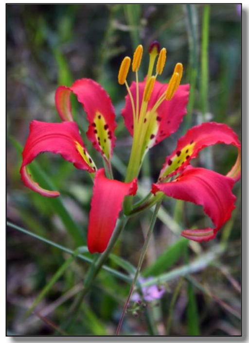
And they found over twenty beautiful lilies in full bloom.!