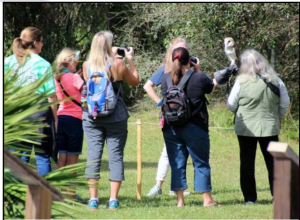
...And the Barn Owl with a crowd of admirers, above . . .

Clearwater Audubon brought owls up close and personal with the public. At left is the beautiful Barred Owl . . .