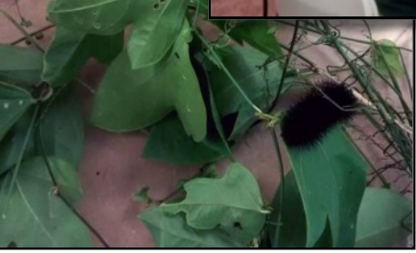
Nature Crafts for Kids stations, and the caterpillar petting zoo (left).