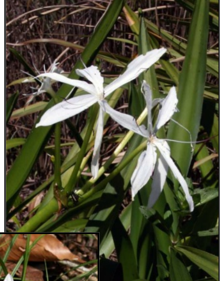
Swamp lily (Crinum lily)

information see Bulbs for Florida on the Internet: <u>http://edis.ifas.ufl.edu/topic</u> <u>bulbous_flowers</u>