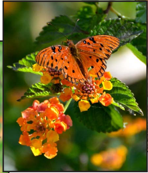
Left to right, Palm Warbler, Gulf Fritillary on Lantana, Lupine