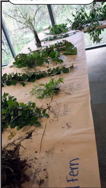
Identifying invasives with Lara