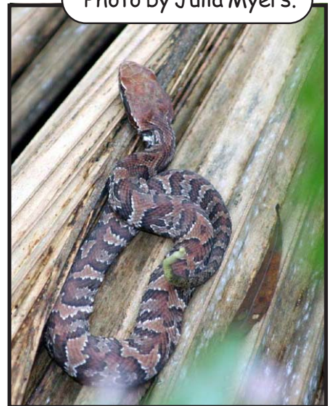
Juvenile Cottonmouth.