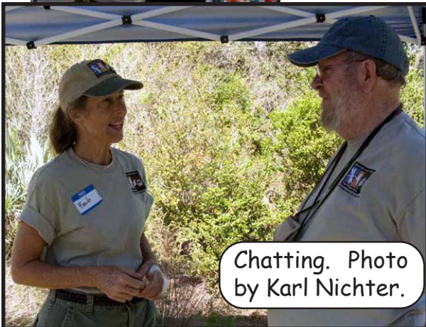
Chatting.