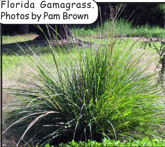
Florida Gamagrass.

Fakahatchee grass; Sand Cord grass ( Spartina bakeri ) that I