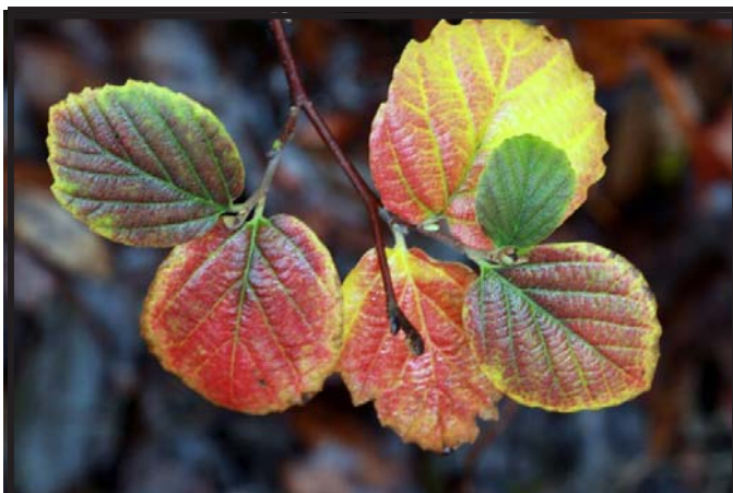
Top, Southern arrowwood ( Viburnum dentatum ) Above, tulip tree ( Liriodendron tulipifera ) Left, witch alder ( Fothergilla gardenii ).