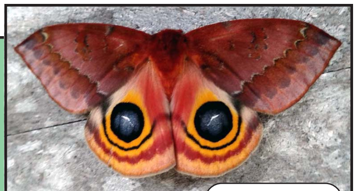
To Moth.