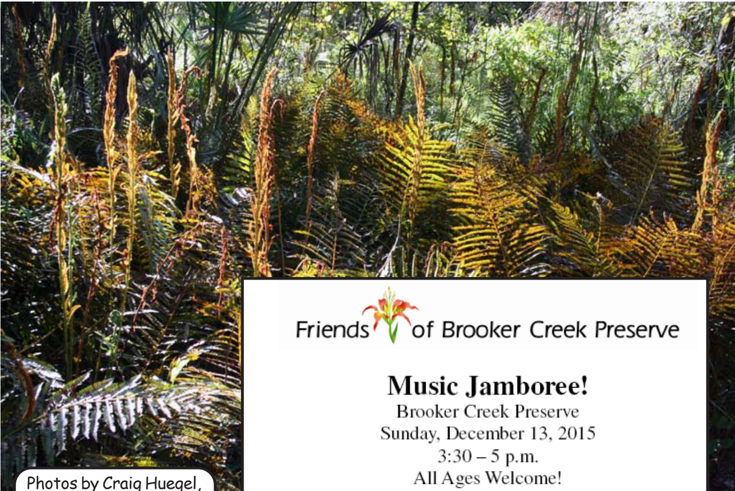
taken during the Fall Wildflower Festival.