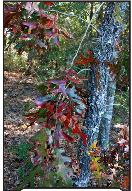
Turkey oak ( Quercus laevis )

The process by which plants judge it to be time to shed their leaves is complex, however, and takes into account a great many more things than reduced day length, otherwise we'd get great fall color in central Florida like areas to our north. Like animals, plants make decisions based on a complex suite of hormones. Various hormones trigger leaf color changes as well as the final leaf drop. Some of these hormones result only from changes in daylight, but others are triggered by other factors such as temperature. The entire soup of hormones that are ultimately involved with fall color is produced by several factors and they do not always come together in the same way. If we have an unusually cold fall here in Pinellas County, we will get a more dramatic show of fall color and it will happen in unison throughout the County - just as it does in North Carolina or Vermont, but if our temperatures stay well above freezing at the time the effect of daylight is causing the leaves to stop producing chlorophyll, the change in color will be in dribs and drabs. It may not even occur at the same time for all leaves on the same plant. A number of years ago, we have several nights of mid-40's F at Alexa's and my home in Seminole in early November. That year, our turkey oak was spectacular. It has never turned those colors again since that fall. Let's hope for a cold (for us, that is) snap this November.