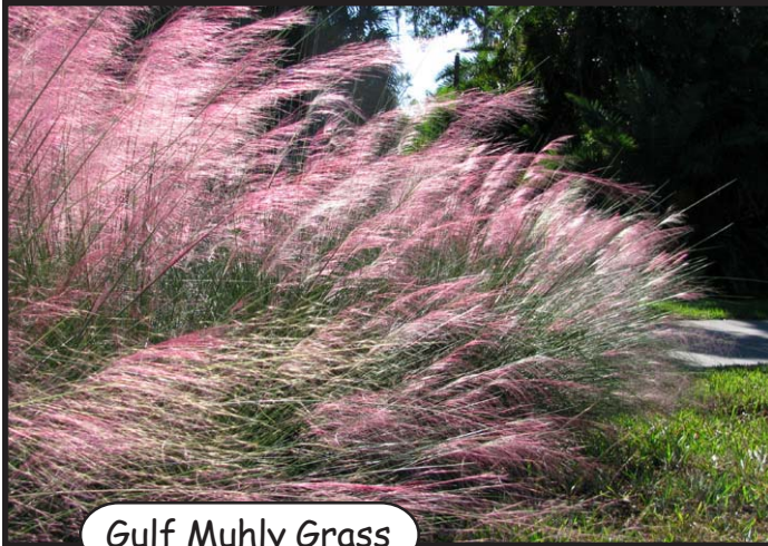
Gulf Muhly Grass

I love ornamental grasses. These grasses add a light airy look to the landscape, especially when planted in groups. We have some great native grasses that make wonderful additions to the landscape. They are not all alike, however, so you need to do some homework before you decide to plant. Many are fairly drought tolerant, or tolerant of a wide range of conditions. Sand cord grass, for instance, will thrive in wet spots near both fresh and salt water, but during a drought it does just as well without significant added water. Also, ornamental grasses provide a different look in the landscape that is a bit more informal, maybe just a little wild! To keep ornamental grasses looking good, they benefit from having the brown foliage removed in the spring by cutting the clump back to about six to eight inches before new growth emerges. This will keep the clumps looking fresh.