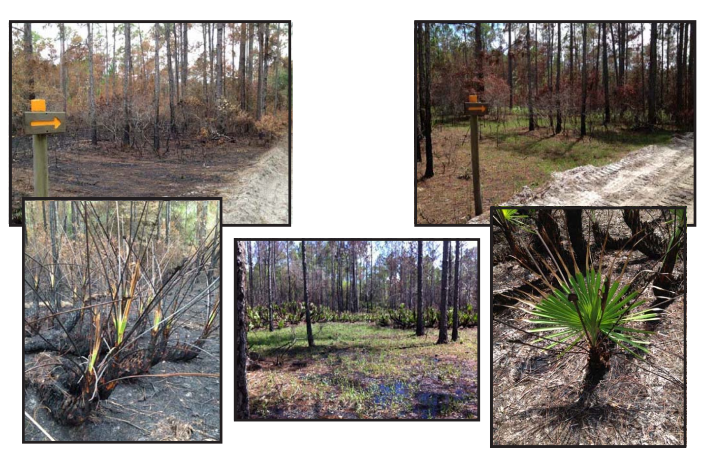
On May 25, 2012 two wildfires, caused by lightning, occurred in the Preserve. Pictures on the left are from May 31 and the pictures on the right show the rapid recovery of this area as of June 21, just twenty-one days later.

As we approach the summer fire season, you will see stories about wildfire and there might even be one or two emanating from Brooker Creek Preserve. As you listen to those news reports, understand the real ecology of fire and its role in the real world.