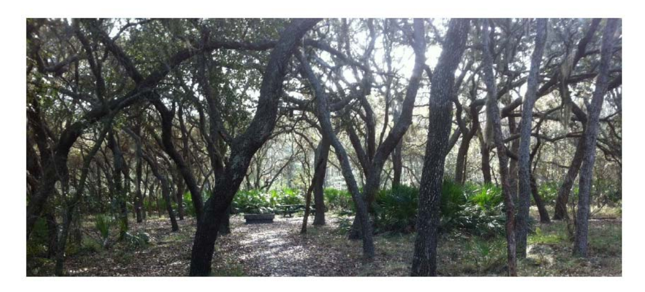
A Special Hike at Four Lakes Hammock Just for YOU!