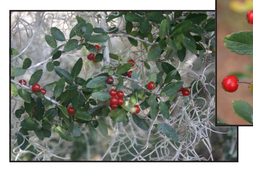
Above, littlehip haw fruit. Left, Yaupon holly.

Look to your landscape to work as your bird feeder. Incorporating trees and shrubs that produce large numbers of bird fruit that last through the winter, can make a huge difference in keeping birds around your home, and will also enhance your landscape's aesthetics. The list below includes some of the best native species for this purpose. Some, like hollies and wax myrtles, are dioecious - meaning that each plant is either a male or a female. For those types of plants, you will want a majority of females to maximize the numbers of fruit produced in your landscape. If your nursery does not sex these plants in their pots, ask for help in sexing them before you make your purchase.