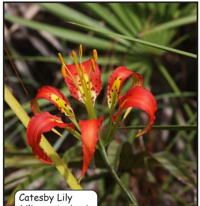
Catesby Lily Lilium catesbaei

sessions progressed in the auditorium, the classroom was filled with kids learning ecological lessons and a large butterfly tent drew families in for close and personal experiences. The excited squeals of children coming from the butterfly tent and the sight of a group of young girls eagerly walking the trails in pursuit of viewing wildflowers for the scavenger hunt was heartwarming. I was so very glad to see children enjoying this beautiful property. I was tremendously impressed with how the "Friends" volunteers ran this event. It was very organized and provided an excellent family outdoor environmental experience. Thanks to everyone involved. And my Catesby? To the sounds of two serenading red-shouldered hawks, I finally got my Catesby photographs!