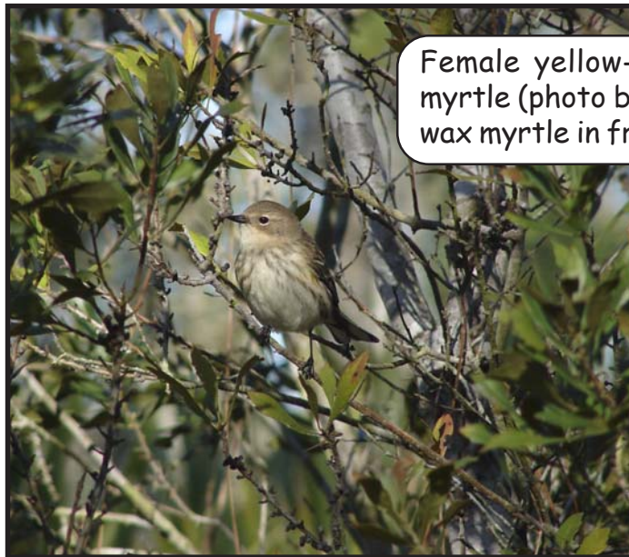
Female yellow-rumped warbler in a wax myrtle. Below, wax myrtle in fruit.

Small fruit is more universally used by birds than larger fruit during the winter because birds need to be able to swallow it whole. Therefore, fruit-producing plants that hold their ripe fruit into the winter are especially important, more so if the fruit is small like that of the wax myrtle. Other shrubs at Brooker Creek that fit this model are beautyberry, Walter's viburnum, and the hollies - yaupon, Carolina, and gallberry. The most significant trees are dahoon holly, cherry laurel, swamp bay, and tupelo. As you hike the various trails at Brooker Creek Preserve, watch and listen for bursts of energy caused by small birds. Chances are, you will find that these areas have large patches of wax myrtle, or one of these other plants, too.