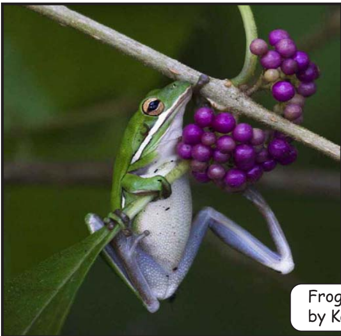
Frog & beautyberry fruit

Extended guided hikes: Nov. 26 and Dec. 24, Saturdays, from 9:00 to 11:30 am.