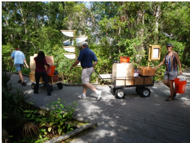
Everything must be transported back and forth between where we work, usually the classroom, and the Bee Shed.