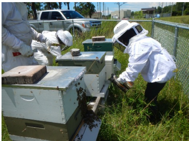
Currently we have three hives in the field, each with one queen and about 40,000-50,000 workers (her daughters).