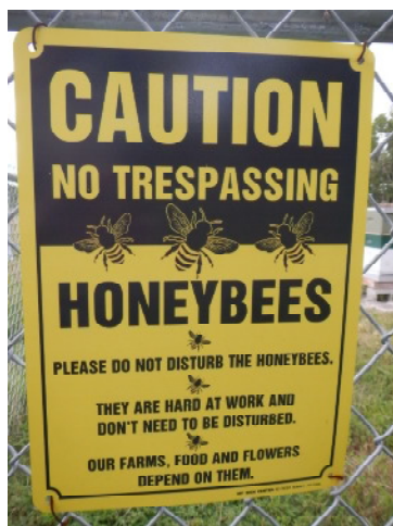
We love visiting our apiary!