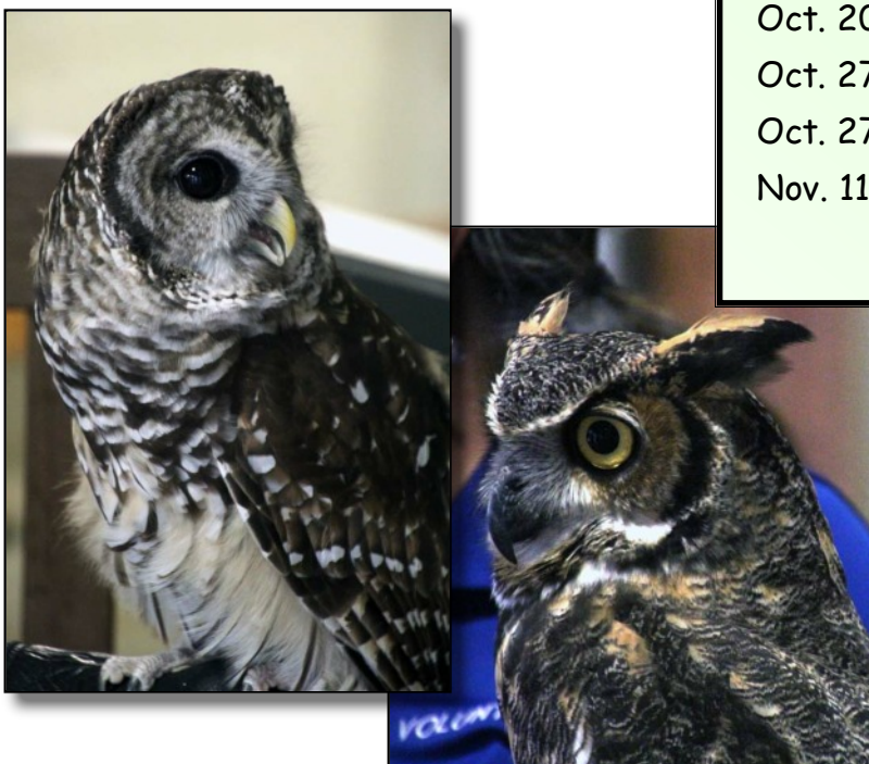
The beautiful barred owl (left) and great horned owl helped us celebrate last year's Owl-O-Ween.