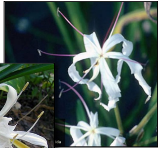
Above, swamp lily, left, spider lily.

The spider lily ( Hymenocallis latifolia ) is also a Florida native with attractive foliage and fragrant white blooms. This clumping perennial has long, dark green leaves that grow directly from an underground bulb and reach a height of two to three feet. In summer and fall, the spider lily produces many gorgeous white flowers that are fragrant, long-lasting, and delicate.