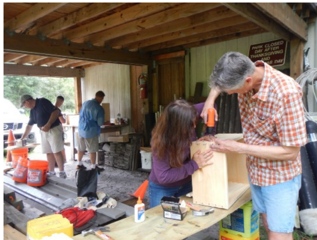
Sometimes we work in the classroom, other times we work outside by the Bee Shed.