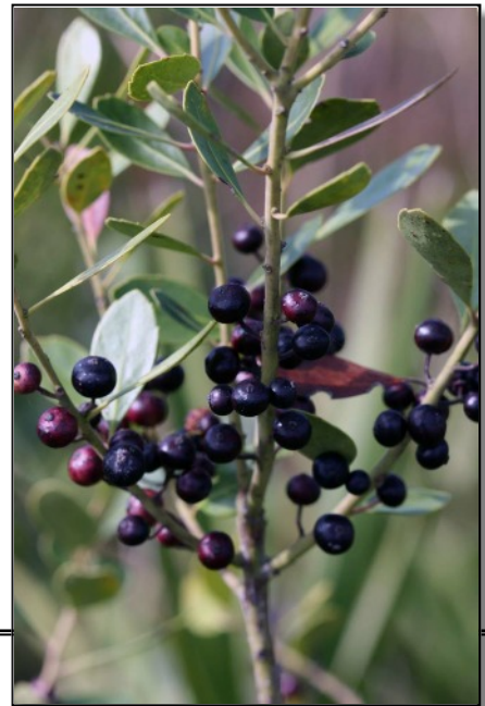
Gallberry fruit

If you have visited our Nature Store throughout the summer, you may have noticed our honey supply dwindling. Good news! The honey shelf is now fully-stocked and we have plenty more on hand. We carry the well-known Orange Blossom Honey, as well as the popular Allergy Honey (a wildflower blend). Gallberry Honey is a lesser-known, but just as tasty, variety. At the Nature Store we are often asked what gallberry is. Gallberry ( Ilex glabra ) is a native shrub in the holly family. It grows in the pine flatwoods of the Southeastern U.S. and right here at Brooker Creek Preserve! You may notice it as you hike the nature trails. Its oval leaves are a bit waxy and shiny, and it produces a small, black, bitter berry-type fruit. In the spring, the bush blossoms with white flowers that drip nectar, attracting bees and other pollinators. Gallberry honey has a rich flavor, perfect for table-use or for baking. I encourage you to give it a try!