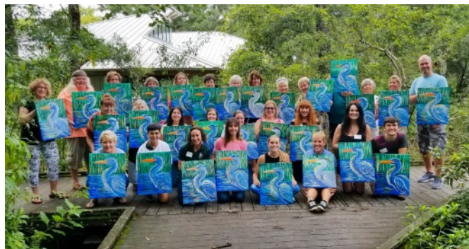
Voila! 28 Blue Herons, each with its own personality!