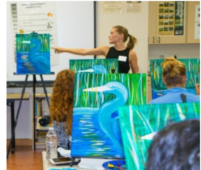
Add depth and details.