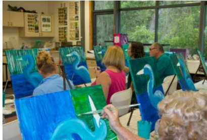
Fill in the heron.