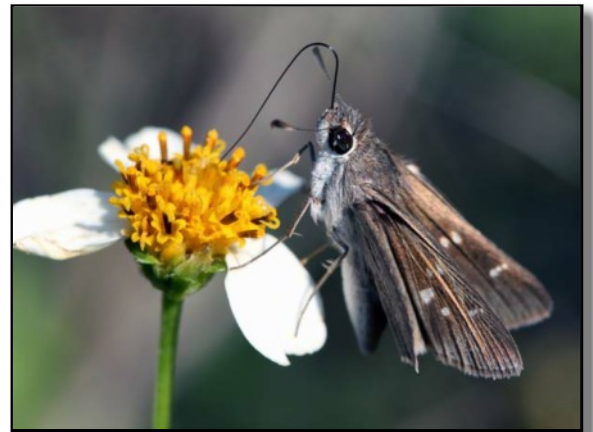
Dotted skipper with Spanish needles.

Spring-blooming plants, on the other hand, sense the lengthening of daylight (the increased shortening of night) and prepare to bloom as soon as spring has truly arrived. Most of our showiest native trees are long-day plants, as are the spring-blooming wildflowers such as violets. Blooming in the spring allows them to capture the attention of pollinators as soon as they become active too and their seed generally sprouts quickly so they have most of the growing season to grow and mature before winter.