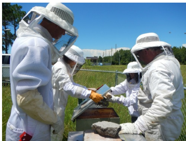
Everything here is done slowly, carefully, and quietly.