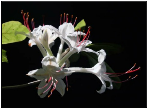
Swamp azalea ( Rhododendron viscosum )

Seed of fall-blooming plants generally lies on the soil surface until spring. The few that sprout quickly produce seedlings that are less cold sensitive than their parents. In my little home