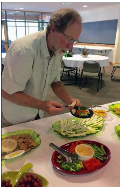
Members of the Friends Board of Directors provided a delicious spread of finger-food!