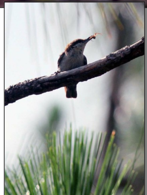
Counterlockwise from top left: Florida Sandhill Crane, Black-bellied Whistling Ducks, Brown-headed Nuthatch, Tarflower.