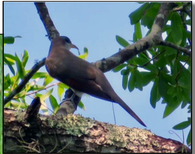
Eastern Meadowlark, Yellow-billed Cuckoo.