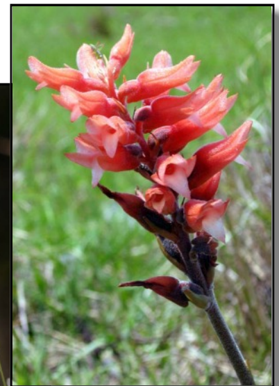
Top to bottom - Bearded grass pink, Calopogon barbatus Crested coralroot, Sacoila lanceolata Snowy orchid, Platanthera nivea .