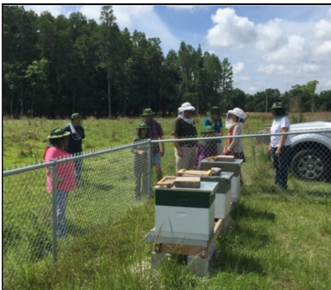
Members visited the two hives located near the Preserve at the first meeting on May 19, 2018.